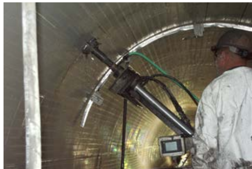
Grouting methods used for seepage control of in-service tunnels.