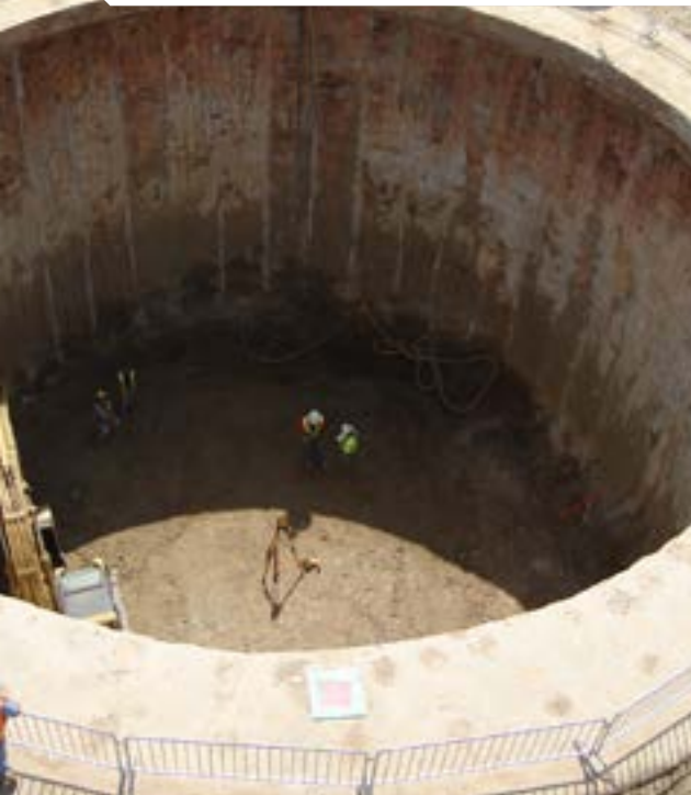
Jet grouting can be used for the lateral support of excavation as well as a bottom seal.