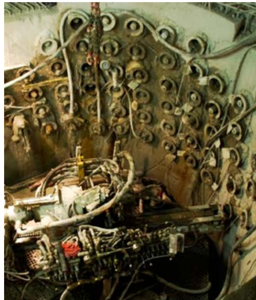
Access shaft for the installation and grouting of compensation grout pipes.