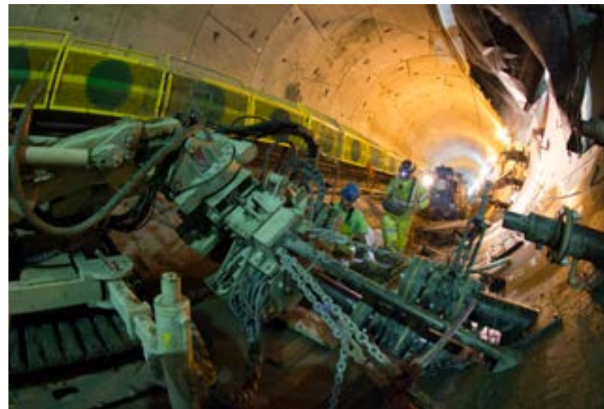
Keller has extensive experience with drilling inside of tunnels for the installation of grout pipes, freeze pipes, canopy pipes, instrumentation, and lances.