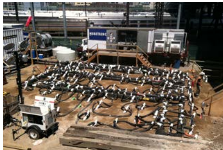
Ground freezing (shown) and jet grouting are used for the construction of safe havens.