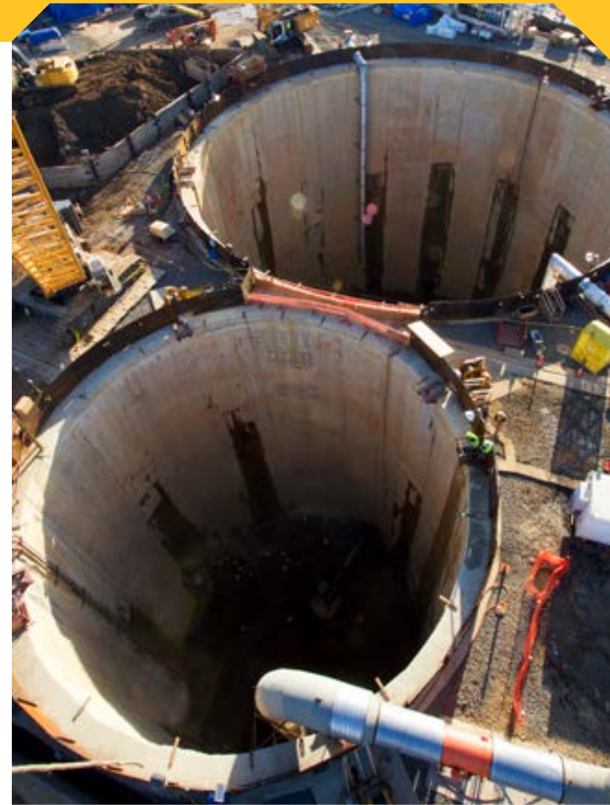
Binocular diaphragm wall shafts.

Similar to hydromill panel excavation, cutter soil mixing (CSM) uses a twin cutter wheel tool to soil mix panels. Our ground freezing expertise has progressively grown since the 1970s and has become widely accepted, particularly in difficult or disturbed ground conditions and where 100 percent assurance is required. Keller brought jet grouting to North America, where we remain the most experienced and accomplished grouting contractor. Grouted bottom seals or dewatering/pressure relief methods are just a few tools that Keller can use for groundwater control for deep stations and shafts. In addition, we have worked on every US subway system since 1970, using a range of techniques, and our versatility and experience speak for themselves.