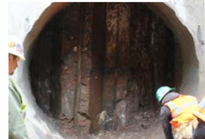
A microtunnel launch stabilized with permeation grouting.