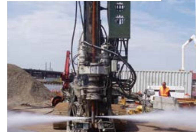
High-pressure jet grouting.