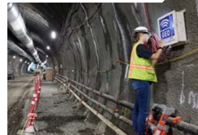
Monitoring of strain gauges on lattice girders to verify load distribution on SEM tunnel lining.