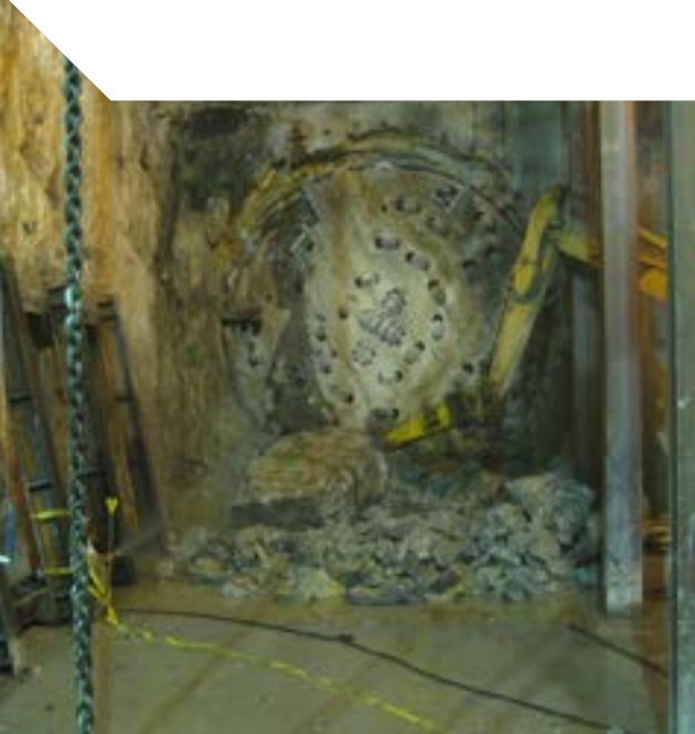
Rock curtain grouting methods used to improve the rock where retrieval occurred with a very thin pillar.