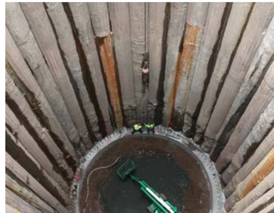
Secant piles for deep shaft support of excavation.