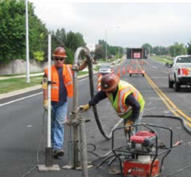
Compaction grouting is often the quickest way to compensate for ground loss and counteract settlements that occur with tunneling.

No matter where in the country your tunneling project is, and no matter how complex the challenge, Keller is around the corner and poised to work with you to develop the best solution.