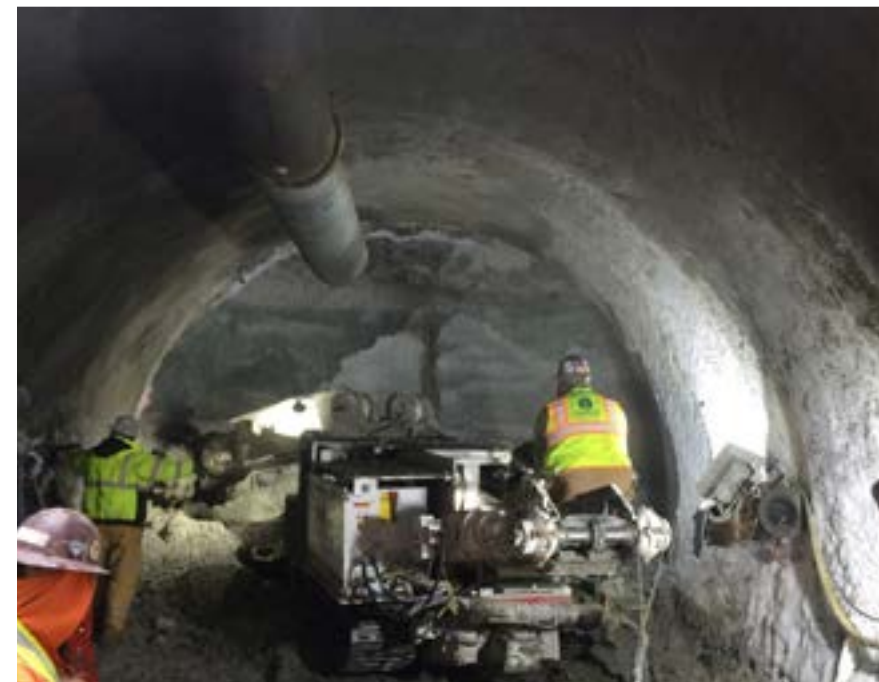
Connector tunnels and adits can be effectively improved, full face, at considerable depth below the water table with jet grouting, ground freezing, and permeation grouting.