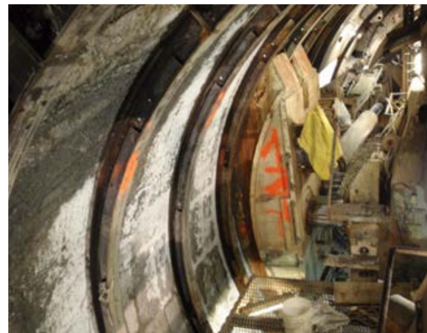
Ground freezing used to provide rock-like conditions through a mixed face TBM tunnel reach.