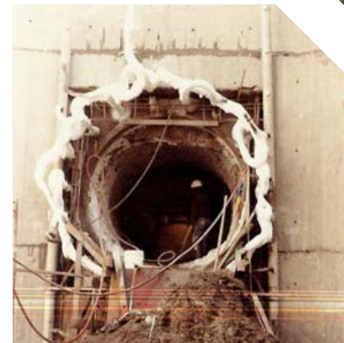
Liquid nitrogen is very cost-effective for ground improvement of small connector tunnels.