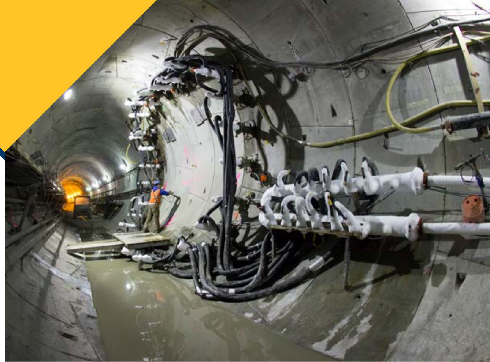
Cross passages are inherently difficult to access. Ground freezing and permeation grouting are readily adaptable for implementation from within the tunnel.

Permeation grouting can similarly be performed from the surface or from within a tunnel. Jet grouting also conforms well to pre-existing structures, offers a high degree of seepage control, is possible in a wide range of soil conditions, and can be performed inside structures where the drilling is near vertical. Soil mixing is typically a surface-only technique and has been highly effective in some soils that do not lend themselves well to permeation or jetting. Since underground work is often constructed below the water table, some form of dewatering is typically required during construction. Keller has been the nation's leading dewatering and groundwater control practitioner for underground construction since the early 1920s.