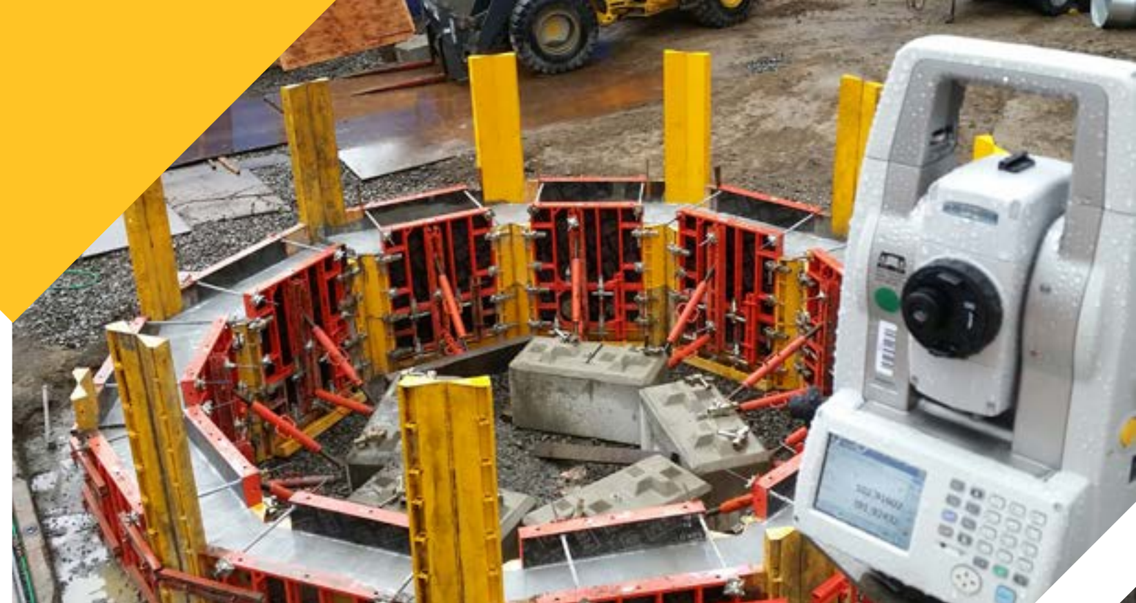
Keller is particularly experienced with monitoring on large projects which require multiple AMTSs, linked together for a strong optical monitoring network.

Keller can provide a wide range of instrumentation to inform and guide these mitigation measures and provide continuous monitoring of structures along the tunnel alignment, including subsurface utilities, basement walls, roadway surfaces, foundation slabs, columns, and load-bearing walls. Measurements are collected automatically, processed, checked against alarm thresholds, and posted on dedicated project websites. The project team can view data, graphs, alerts, and reports via their web browsers. Keller is uniquely qualified to combine settlement mitigation with sophisticated instrumentation so that the work is performed seamlessly.