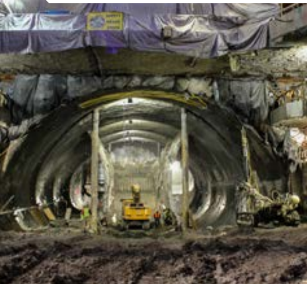
A horizontal frozen arch for groundwater control and structural support of a large SEM tunnel.