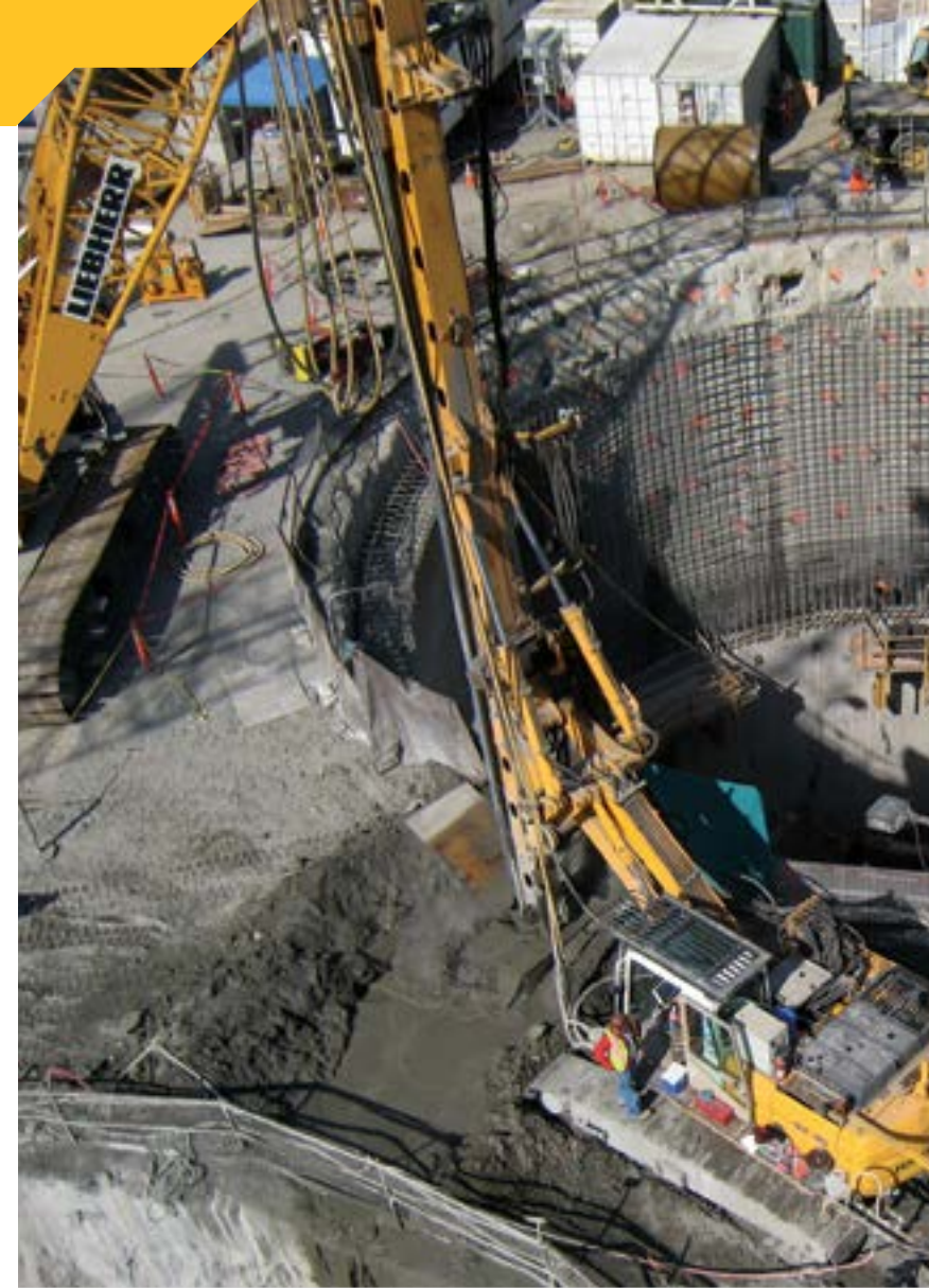
Jet grouting of a tunnel break-in block.

Permeation grouting was a well-established method of stabilizing clean granular soils above the tunnel crown for open-face digger shield mining before the advent of earth pressure balance machines in the early 1990s. However, it still has relevance for hand-mined tunnels to minimize the risk of subsidence during excavation. With all of these options available through Keller and implemented by experienced crews, you can be sure your project is in the best hands.