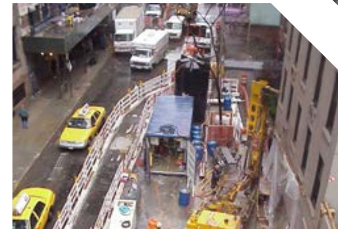
Permeation grouting between a building and future shaft to mitigate settlement of the building from shaft excavation.