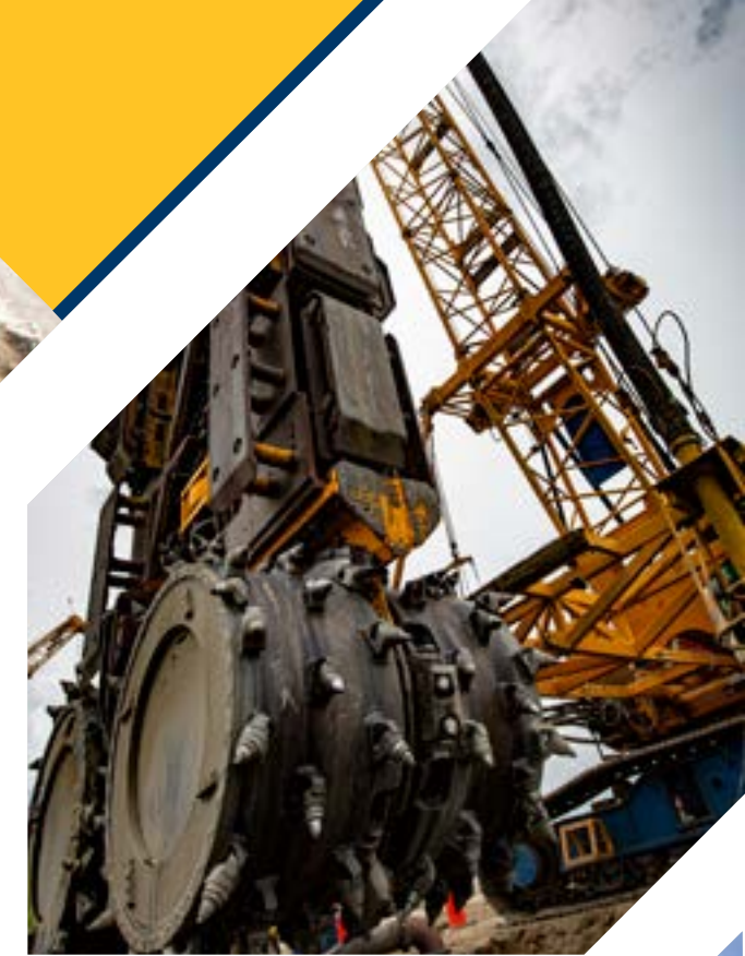
Keller has the largest fleet of hydromills in North America.