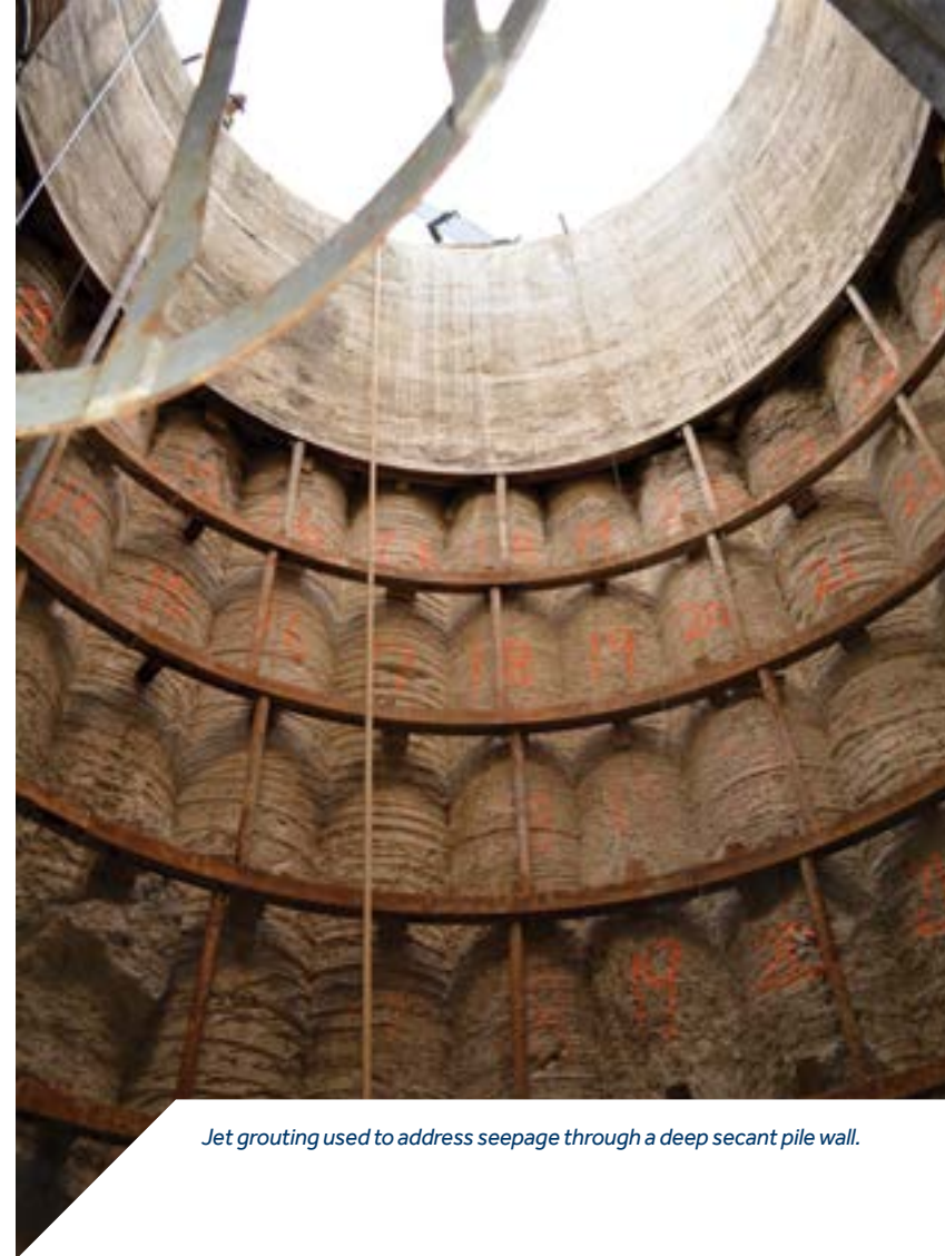
Jet grouting used to address seepage through a deep secant pile wall.

Our tunnel remediation repertoire is as varied as the issues we've corrected and requires the same insights that come with experience. Seepage and long-term ground loss are typical concerns with tunnel rehabilitation. Seepage is difficult to control under flowing water conditions, and the accompanying ground loss can be difficult to trace, but we have the greatest overall experience under such challenging conditions. No matter the most appropriate emergency or remedial response measure, Keller has the expertise and experience to get the job done swiftly and effectively.