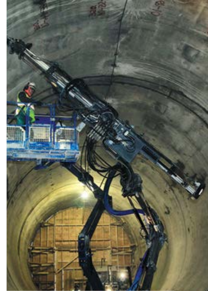
Grouting can be performed inside tunnels for seepage control, contact grouting of a segmental liner, or treatment of ground irregularities.